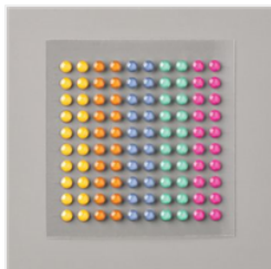
2020-2022 In Color Enamel Dots - 152480