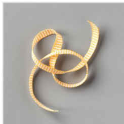
Bumblebee 1/4" (6.4Mm) Gingham Ribbon - 153658