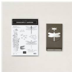
Dragonfly Garden Bundle (English) - 156224