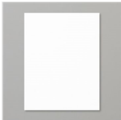
Basic White 8-1/2" X 11" Thick Cardstock - 159229