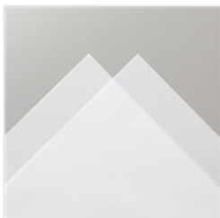
Vellum 8-1/2" X 11" Cardstock - 101856