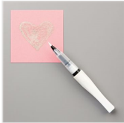
Wink Of Stella Clear Glitter Brush - 141897

wendyklein@doggonedelightfulstampin.com www.doggonedelightfulstampin.com