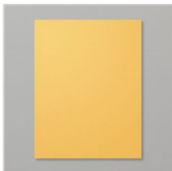
Bumblebee 8-1/2" X 11" Cardstock - 153077