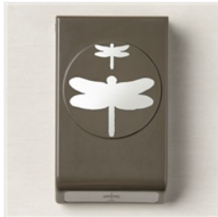
Dragonflies Punch - 154240