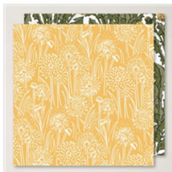
Dandy Garden 6" X 6" (15.2 X 15.2 Cm) Designer Series Paper - 154297