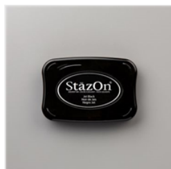
Jet Black Stazon Pad - 101406