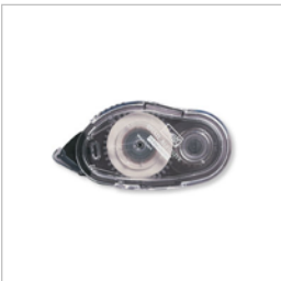
Snail Adhesive - 104332