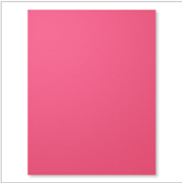
Melon Mambo 8-1/2" X 11" Cardstock - 115320