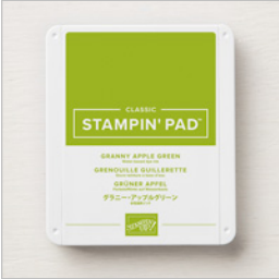
Granny Apple Green Stampin' Pad - 147095